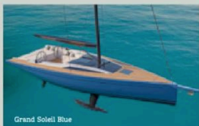
Grand Soleil Blue