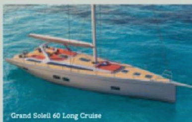
Grand Soleil 60 Long Cruise