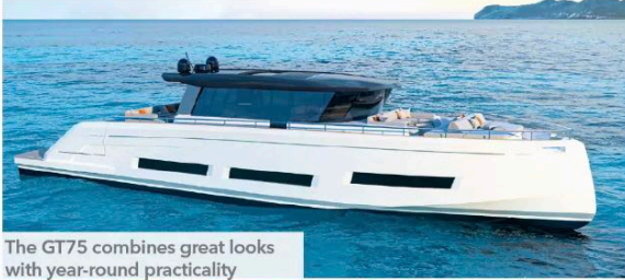
The GT75 combines great looks with year-round practicality

LOA: 75ft 0in (22.85m) BEAM: 19ft 8in (5.99m) ENGINES: 3 x Volvo Penta D13 IPS-1050s/1350s SPEED: 35 knots PRICE: POA CONTACT: www.pardoyachts.com