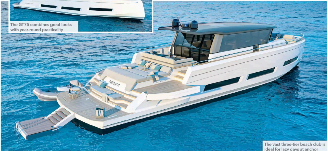
The vast three-tier beach club is ideal for lazy days at anchor

LOA: 75ft 0in (22.85m) BEAM: 19ft 8in (5.99m) ENGINES: 3 x Volvo Penta D13 IPS-1050s/1350s SPEED: 35 knots PRICE: POA CONTACT: www.pardoyachts.com