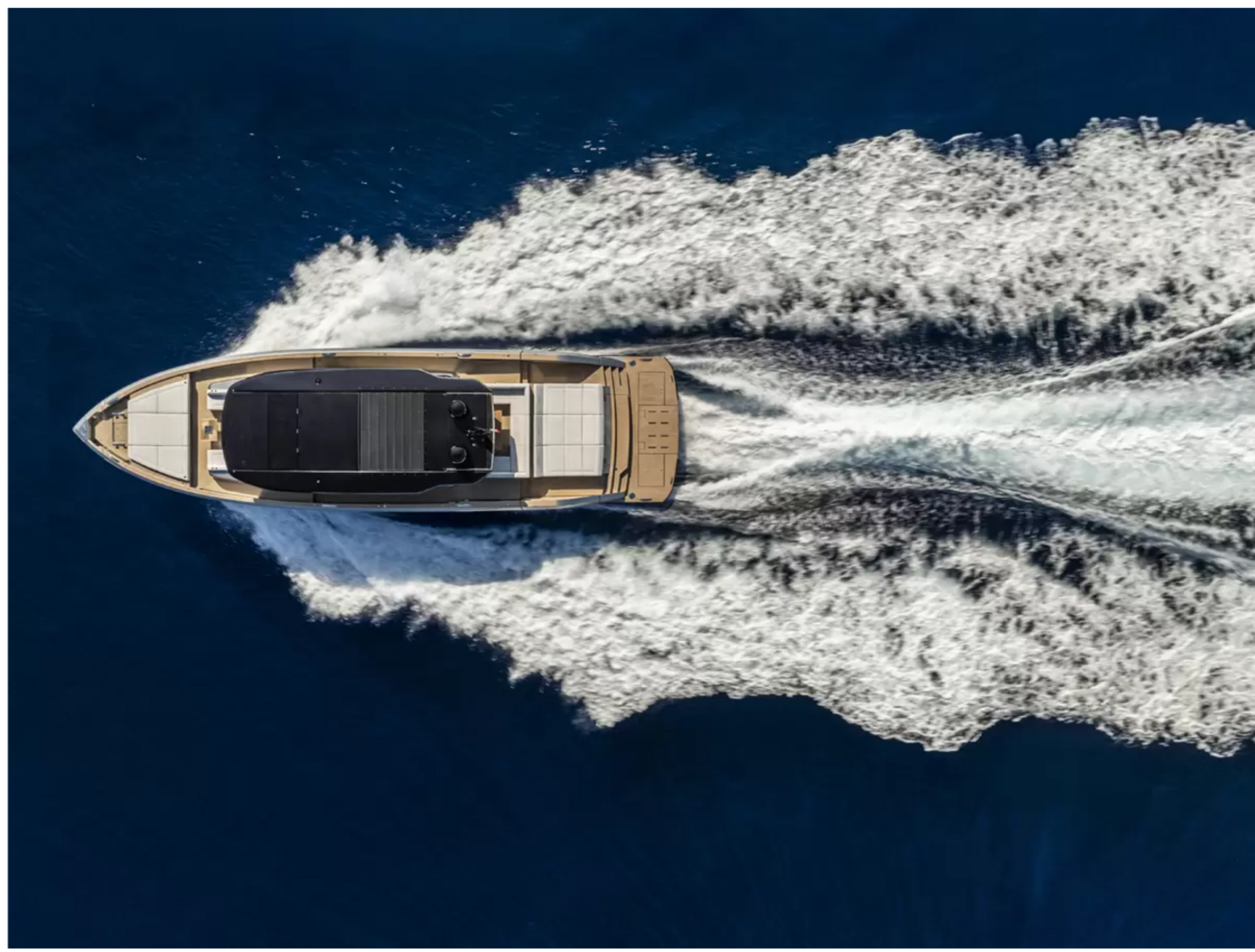
The Pardo GT75 debuted at Cannes Yachting Festival 2024.

Designed by Zuccheri Yacht Design for naval architecture and Nauta Design for interiors and exteriors, the GT75 is powered by a standard engine package featuring three Volvo Penta IPS 1050 units, each delivering 800hp. The hull has been optimised to ensure smooth performance with the Volvo Penta IPS propulsion system, while the engine room is prepared to accommodate hybrid engines.