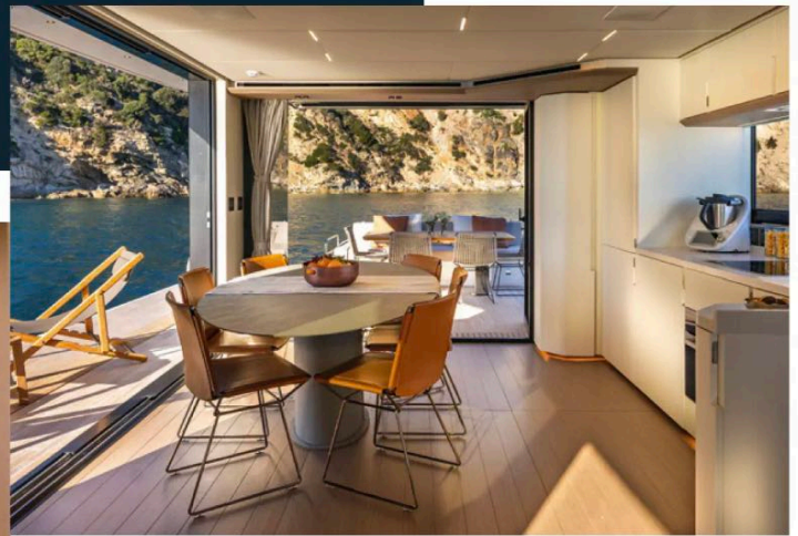
The E72 embraces indoor-outdoor living with opening bulwarks and sliding floor-to-ceiling doors. Left: the VIP guest cabin

below. Or you might prefer to sit on the side decks, feet dangling over the sea, or recline on the foredeck sunpads and take in the views while underway. The moveable, weighted backrests on the latter are a small but clever detail, allowing you to find your ideal lounging position. I also appreciate the generous width of the side decks. Even with the fold-down balconies raised, there is plenty of space to move from bow to stern comfortably, with retractable cleats and the absence of handrails adding to the clean aesthetic.